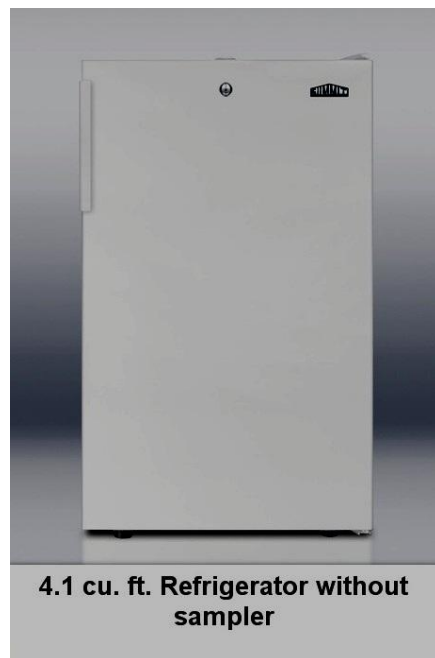
4.1 cu. ft. Refrigerator without sampler